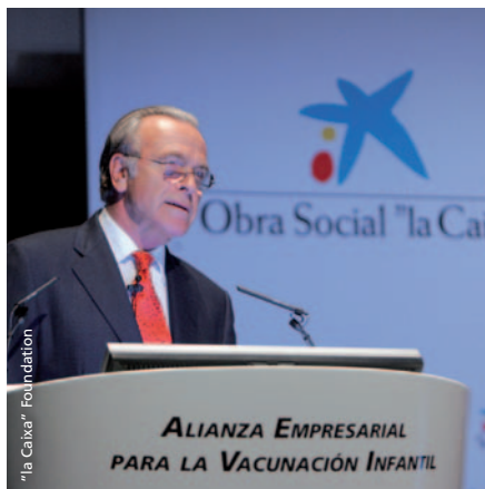
Isidro Fainé, at a presentation of the Business Alliance in Madrid in January 2009.

From the beginning more than 140 companies have collaborated with the BUSINESS ALLIANCE FOR CHILD VACCINATION , donating more than 700,000 Euros.